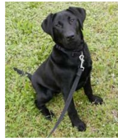
Koda - The pup we are currently sponsoring

The Down Syndrome Society and Foundation 21 both received funding this year and although have no connection as charities, both support children with Down Syndrome.