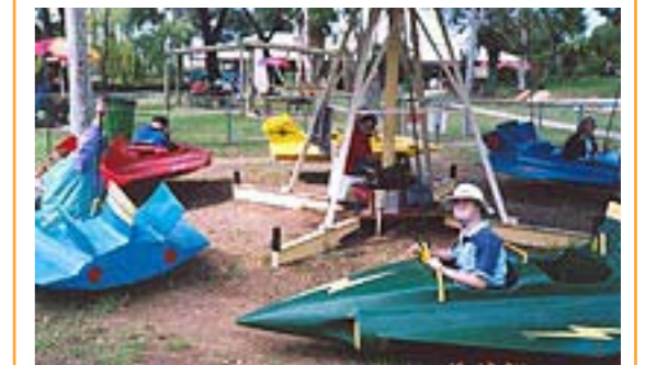
Children enjoying a day out with support from the Down Syndrome Society holiday camp project.